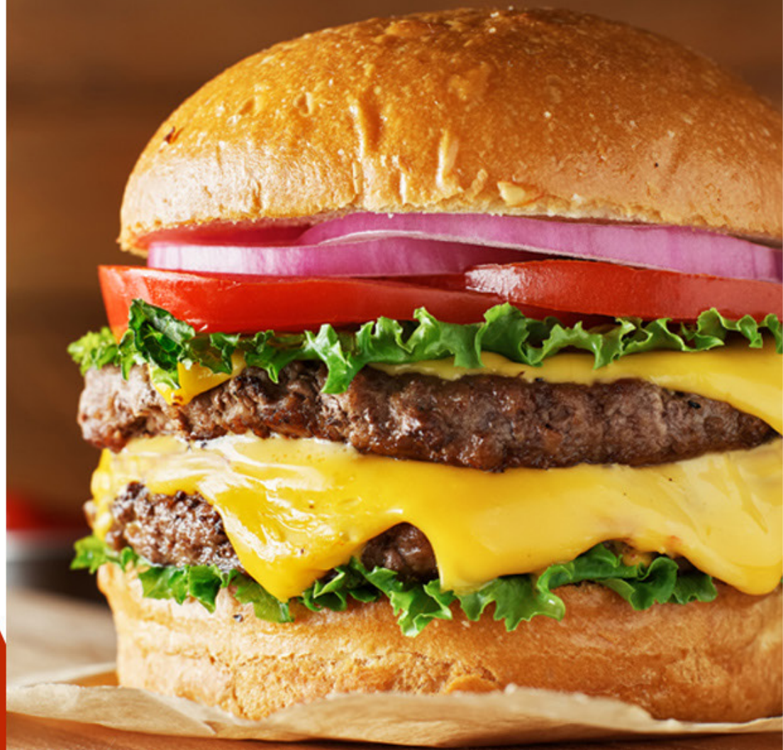
TURTLE CREEK CHEESEBURGER + DOUBLE BURGER PATTY